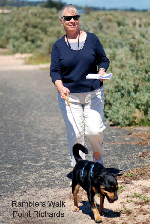
Ramblers Walk Point Richards